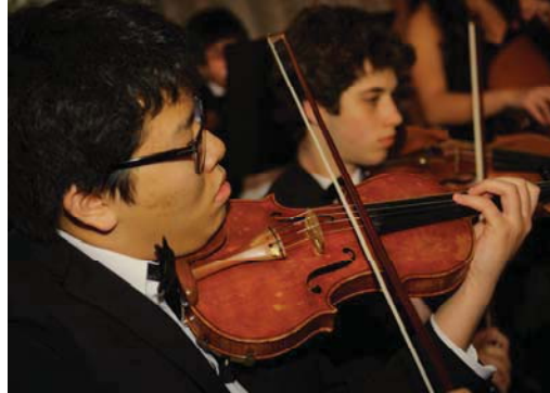
That night's entertainment, The Children's Orchestra Society